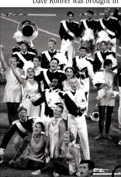
Bluecoats, 1996.