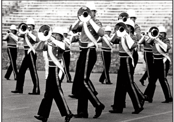
Bluecoats, 1986

The 1981 season was also a banner vear for the corps' Boys Club support. A new Canton Police Boys Club was