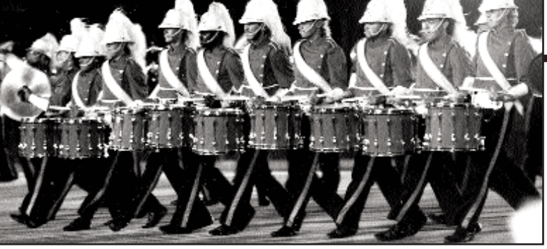
Bluecoats, August 5, 1988, at Montclair, NJ.

the Bluecoats that season and it gave the corps a great head of steam going into the summer of 1987.