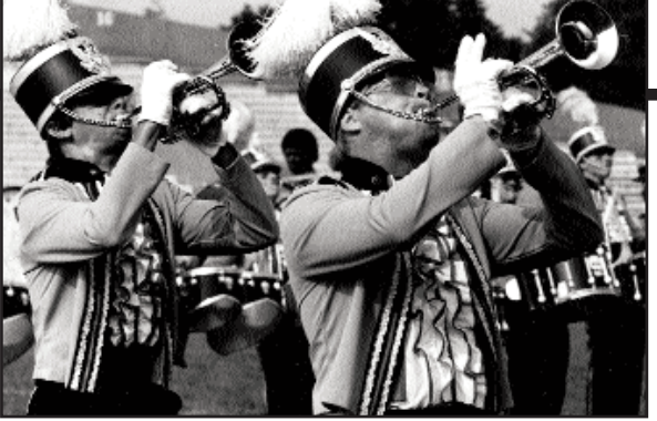
Bluecoats, 1982 (photo by Paul Lambert from the collection of Drum Corps World).

The young musicians chose the name "Bluecoats" in tribute to the police department's retired police officers and as a program of the Canton Police Boys Club. The corps made its debut in competition in 1974, hosting its first "Innovations in Brass'